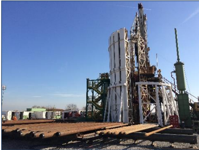
H220 Archimede rig on-site (Nov '17)