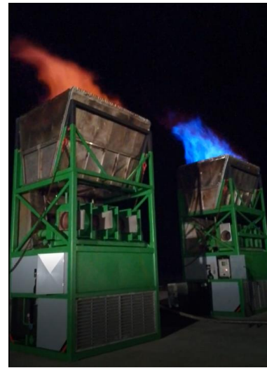
Well-testing (Jan '18)